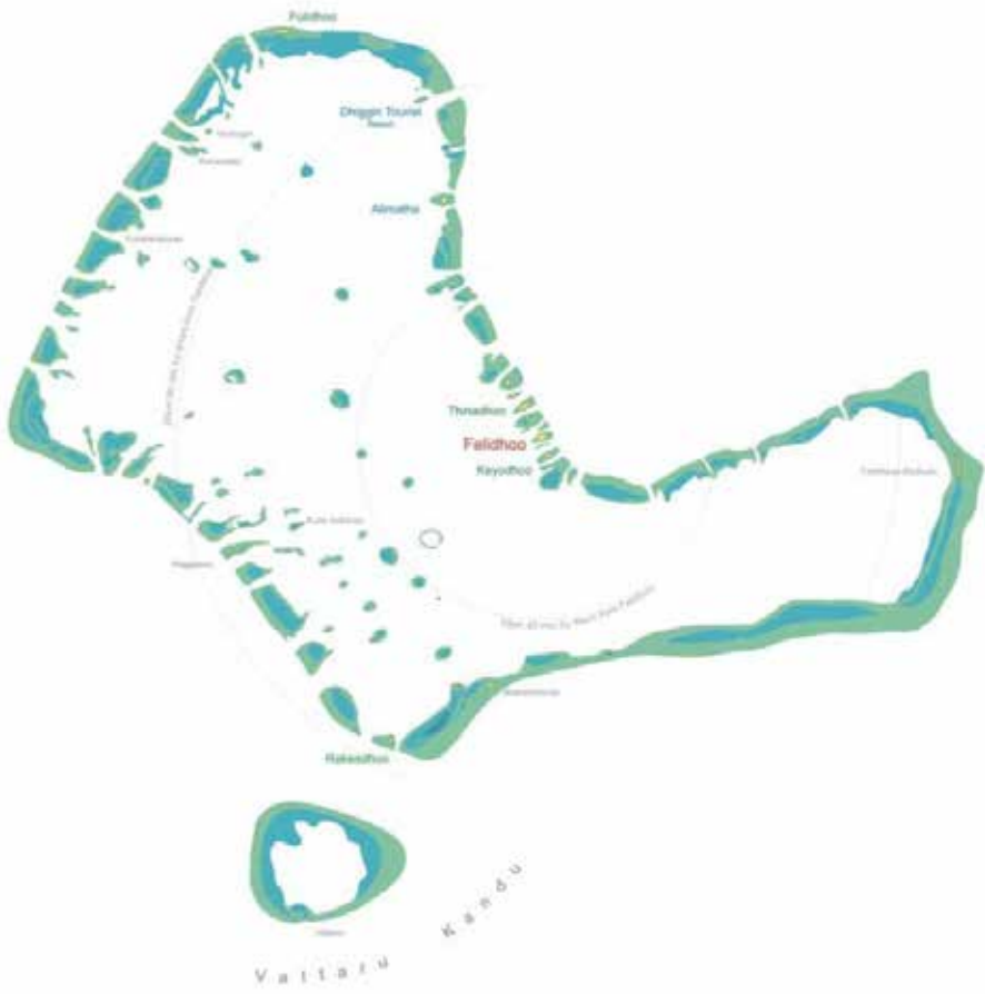
Vaavu Atoll Felidhe Atholhu